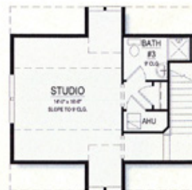
OPTIONAL GARAGE w/2ND LEVEL STUDIO