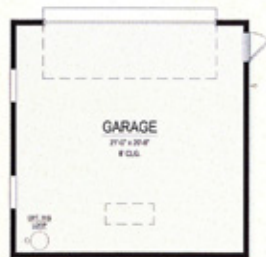
2 CAR GARAGE